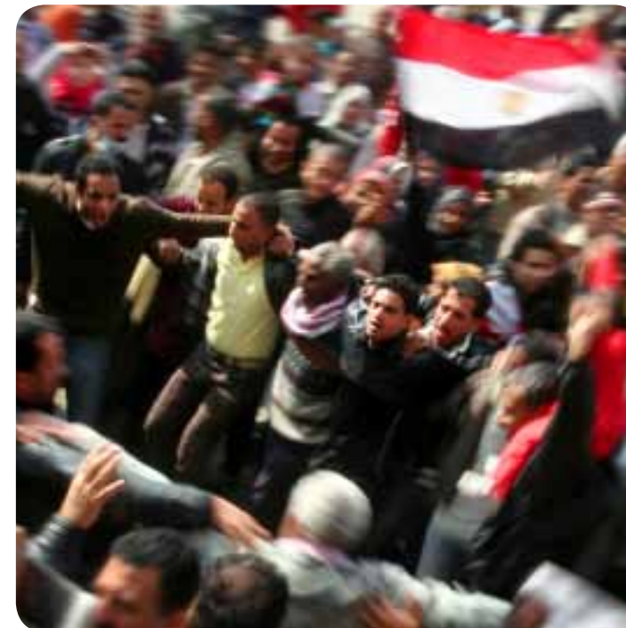
Egyptians celebrate the departure of President Hosni Mubarak

God's love crosses boundaries—boundaries that we have set up in our minds and draw on our maps everyday. That is the story of the Exodus, the story of the One who stood with the underdogs against the violent, and against the powerful.