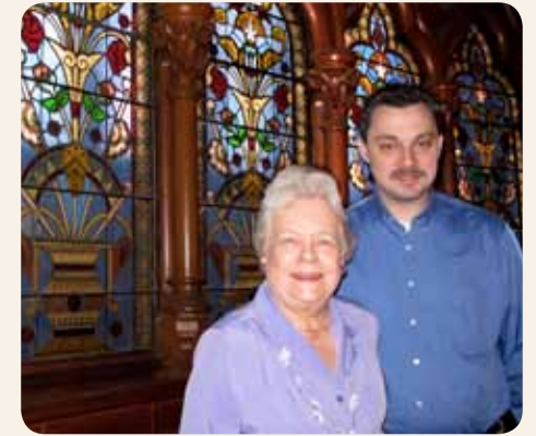
Left: Among the treasures of the Sanctuary is the rose window that rises above the rear balcony, opposite the pulpit.