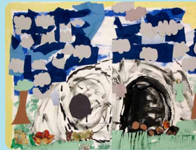
Easter Through the Eyes of Children, an exhibit by the Sunday School classes of FAPC, is on display in the Gallery until early May. Among the creations (left to right): "Jesus Lives in Us!", a joint effort by all classes; "A Midnight Garden of Prayer," by the kindergarten and first graders; and "The Incredible Empty Tomb," by the second and third graders.

and the beginning pastors," the Institute said. "[New] pastors come to experience themselves and congregation members as co-participants in Christian community, partnered in making their way together in the world."