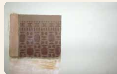
The walls of the church, at least in the balcony, were originally stenciled. The facilities staff has stripped away the paint on a few places to provide a glimpse of the ornate design.