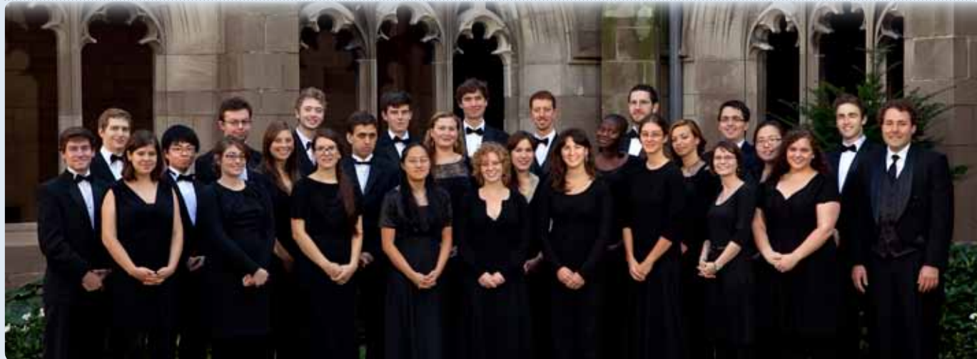
The Motet Choir of the University of Chicago brings its East Coast holiday tour to Fifth Avenue Presbyterian Church on Friday, Dec. 16, at 7 pm in Kirkland Chapel. The Motet Choir will be joined by the Collegium Musicum of Columbia University.