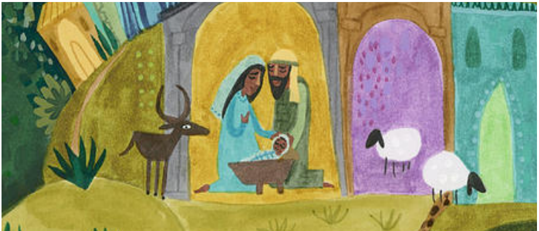
Kate Cosgrove, Nativity Three , 2014