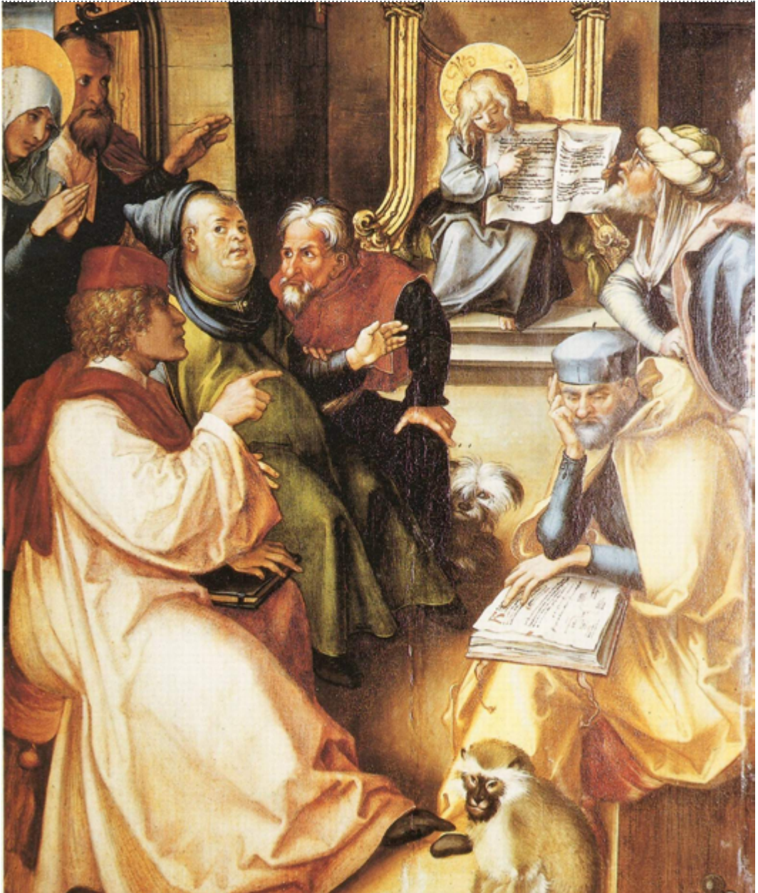
Albrecht Dürer, Twelve year old Jesus in the Temple , c. 1494–1497

FIRST SUNDAY AFTER CHRISTMAS DAY DECEMBER 30, 2018 • 11:00 AM