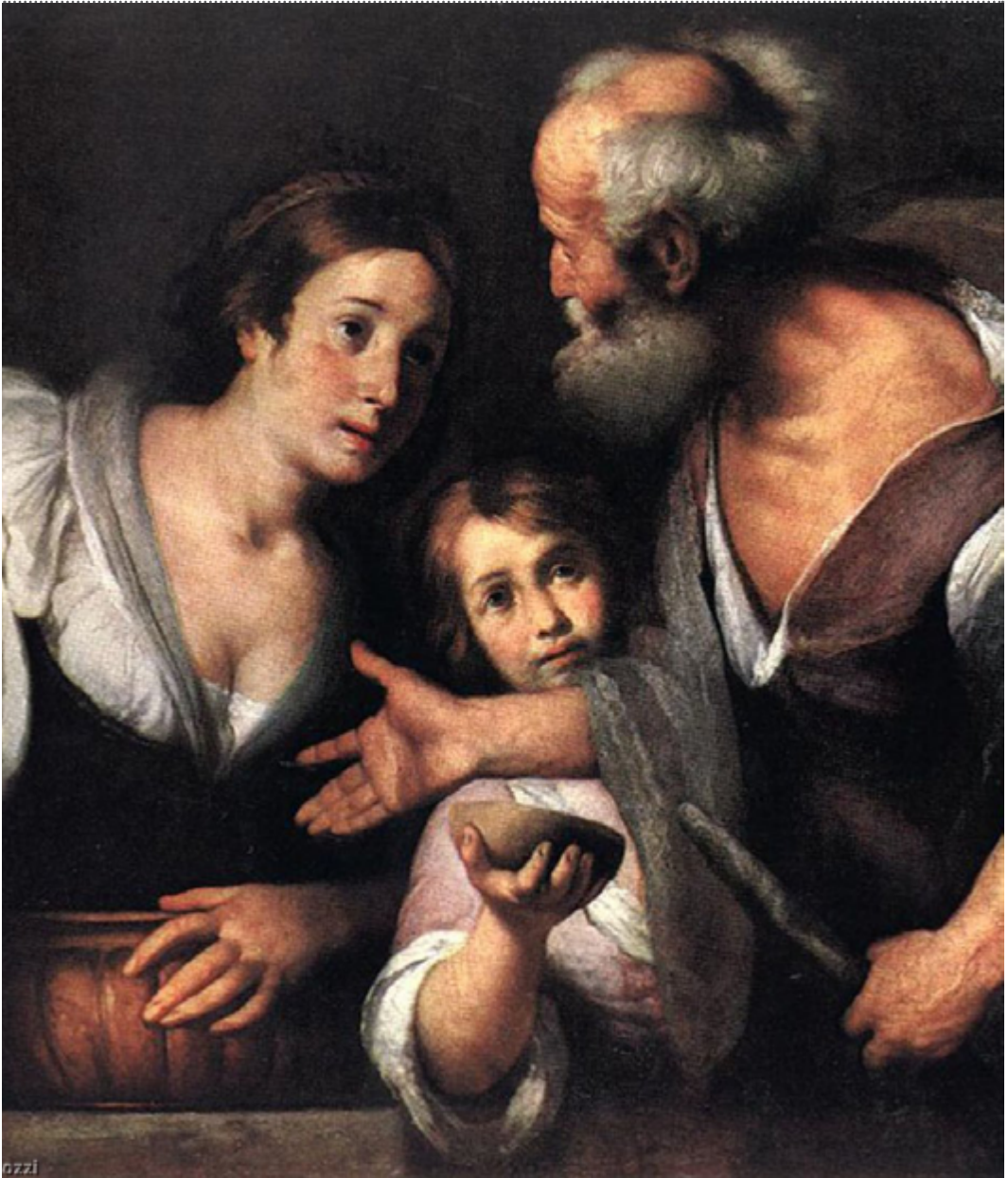
Bernardo Strozzi, Elijah and the Widow of Zarephath , 1630

MARTIN LUTHER KING, JR. SUNDAY JANUARY 14, 2018 • 11:00 AM