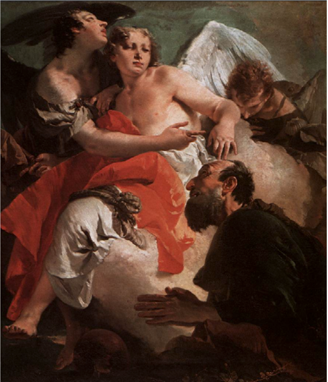
Giovanni Battista Tiepolo, Abraham and the Three Angels , 1730