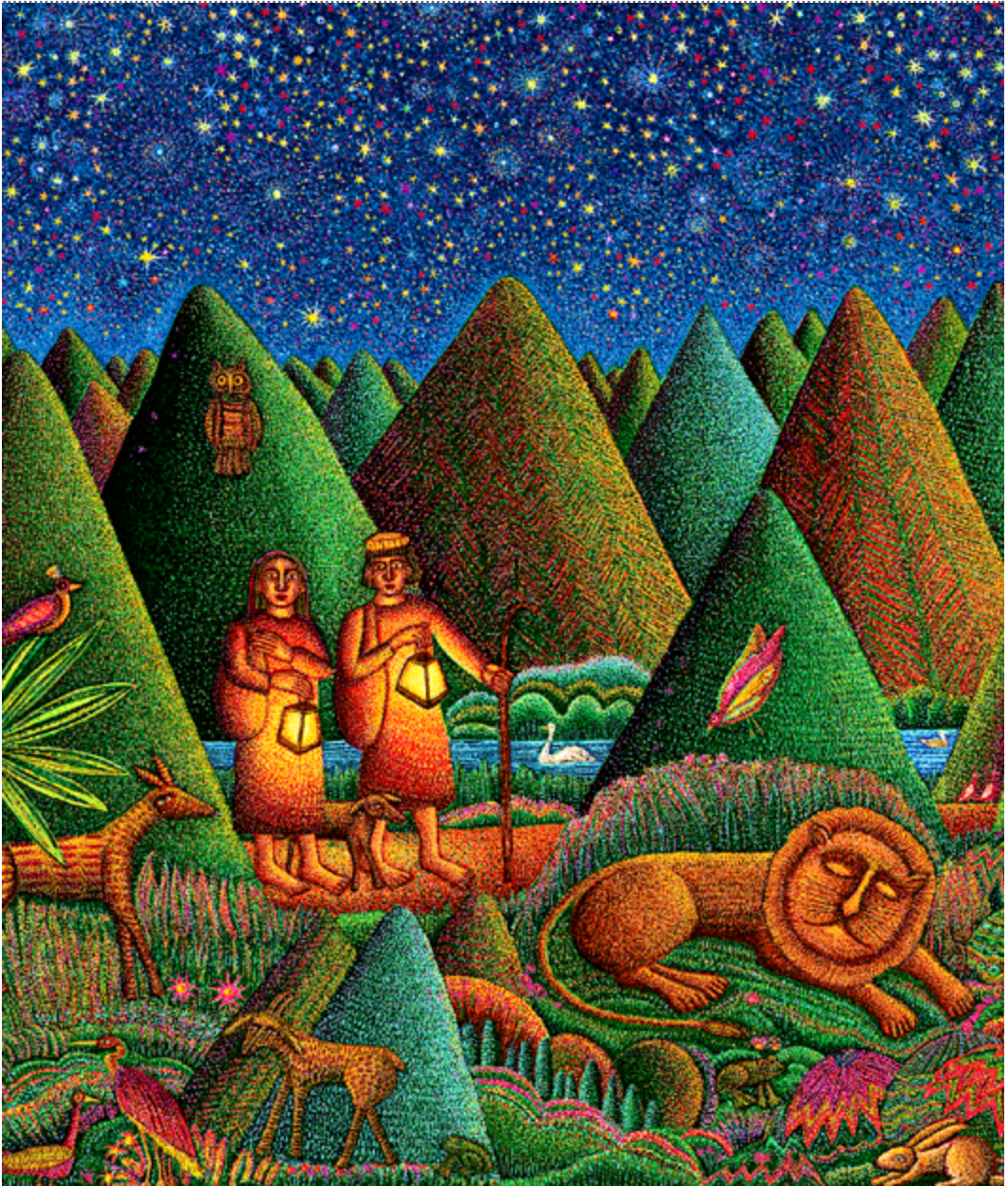
John August Swanson, Psalm 23 , 2010

HOME COMING SEPTEMBER 9, 2018 • 11:00 AM