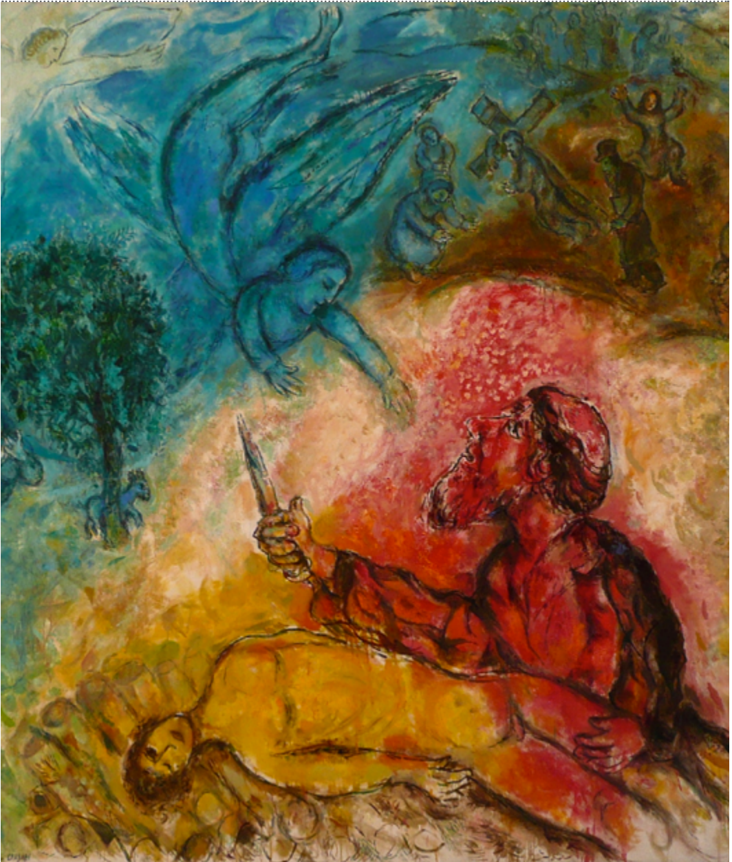
Marc Chagall, Sacrifice of Isaac , 1966