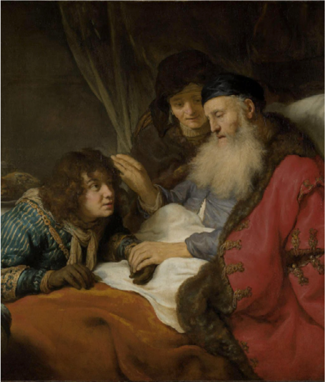
Govert Flinck, Isaac Blessing Jacob , c.1638