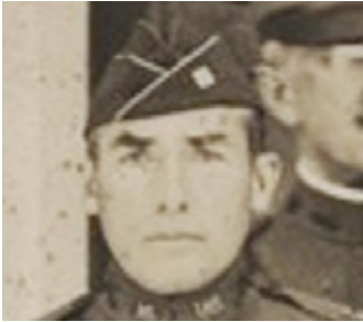
Maj. George G. McMurtry