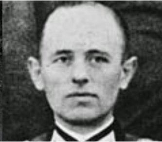
Capt. John Foster Dulles