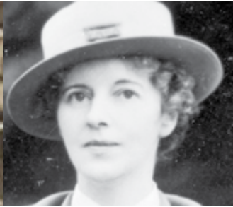
Eleanor Alexander Roosevelt