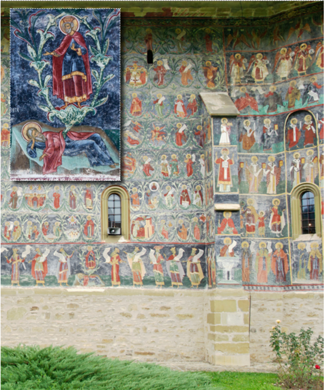
South wall of Sucevita Monastery, Romania