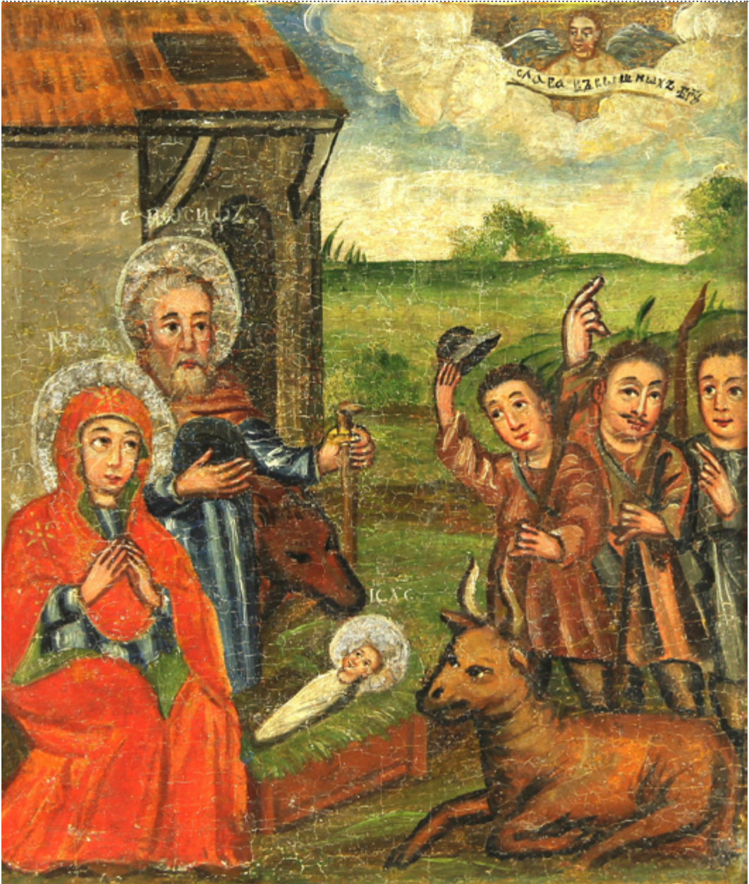
Adoration of the Shepherds, from the Ivan Honchar Museum collection, c. 1670.

FOURTH SUNDAY OF ADVENT DECEMBER 23, 2018 • 11:00 AM