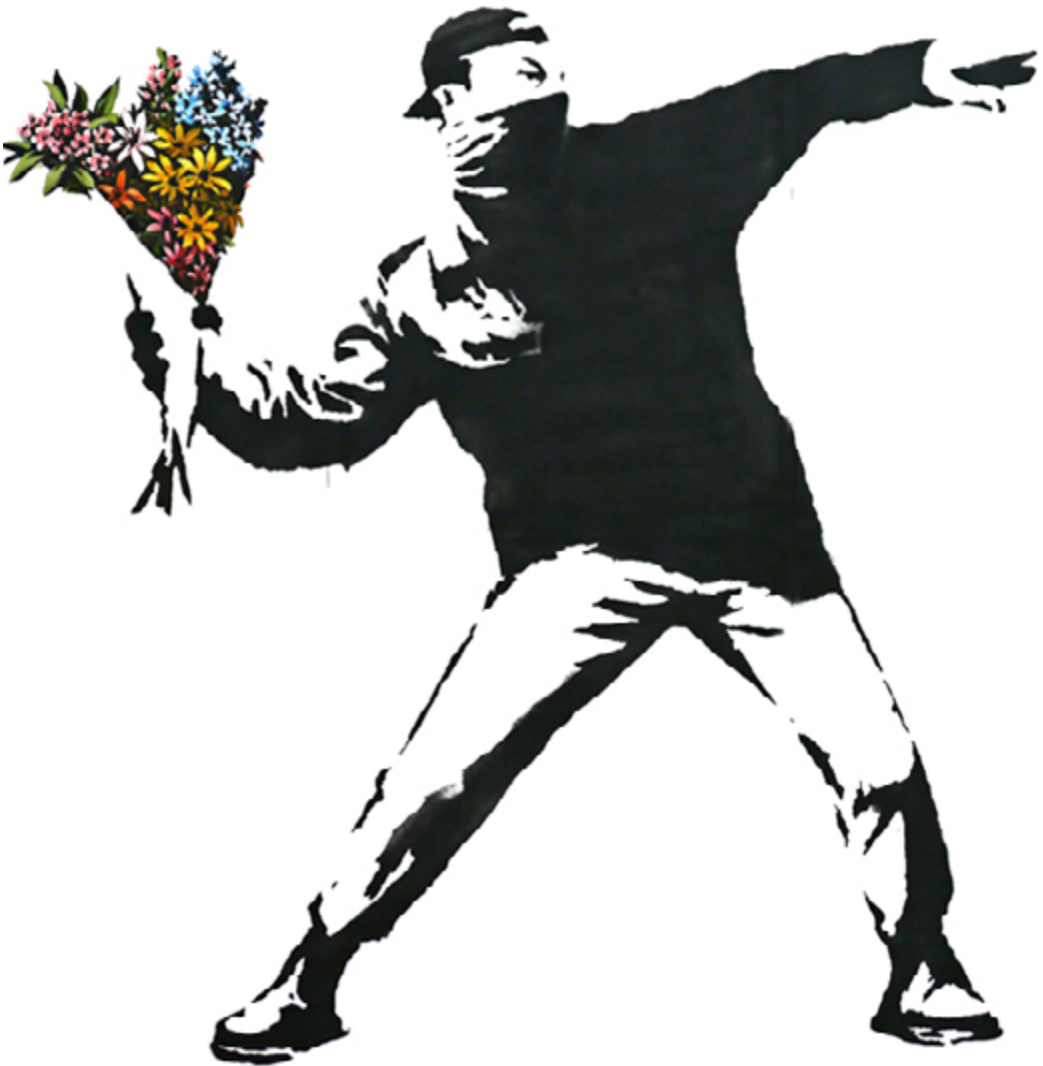
Banksy, Rage, the Flower Thrower , 2005