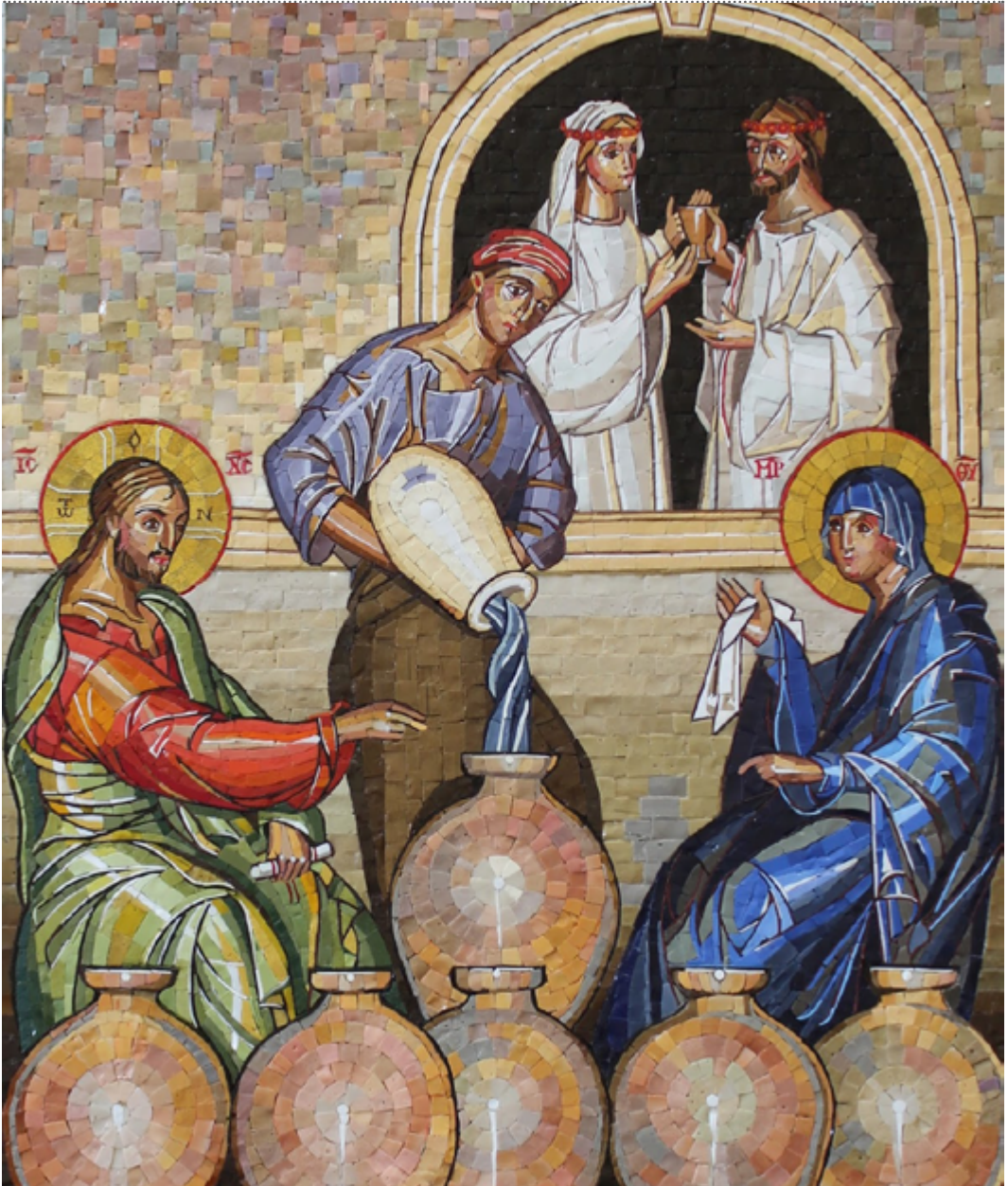
The Wedding Feast at Cana