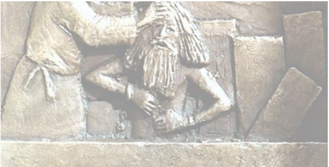
C. Malcolm Powers, Healing of the Gerasene Demoniac , 2000