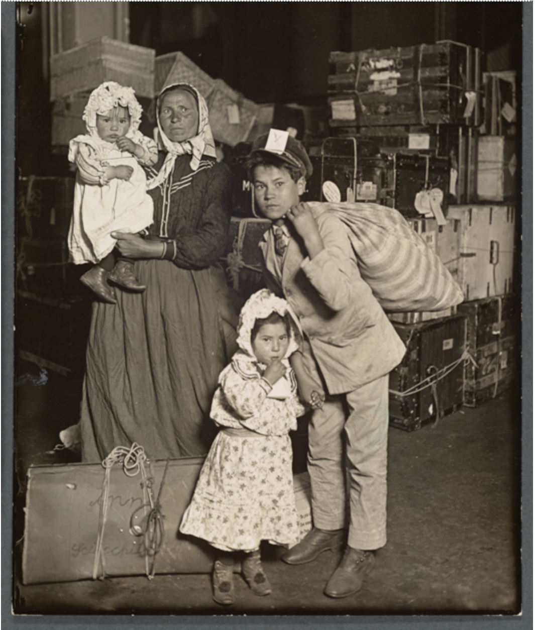
Lewis W. Hine, "Italian immigrants at Ellis Island, 1905." Photography Collection, New York Public Library.