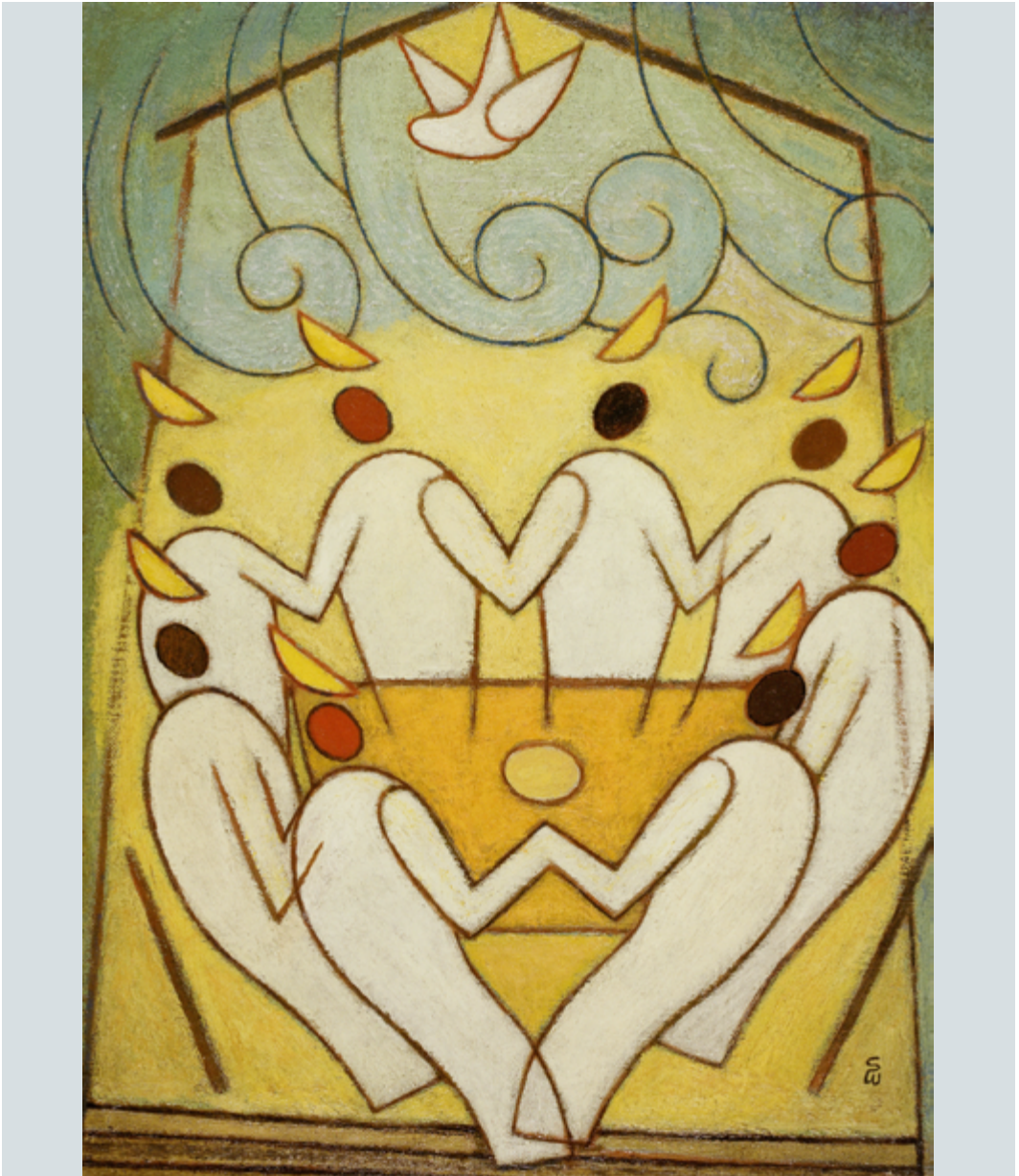
Soichi Watanabe, The Coming of the Holy Spirit , 1996