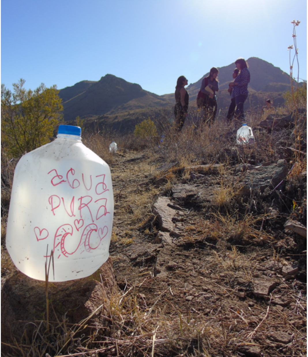
“Leave a Trace” (Photo by Leah Goldberg/Cronkite News, Jan. 17, 2018).