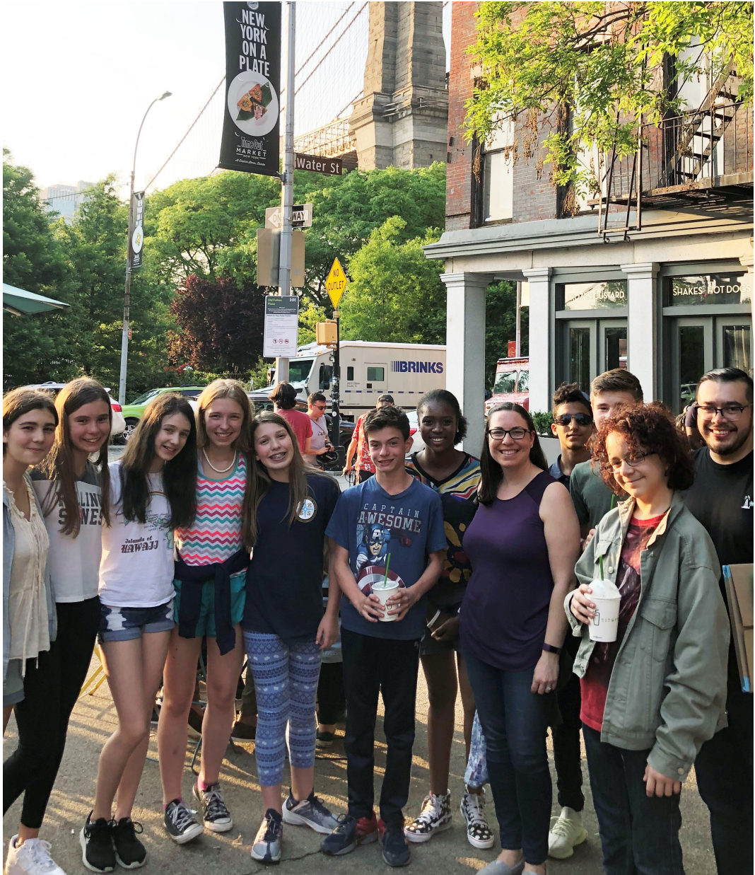
FAPC Youth, May 31, 2019