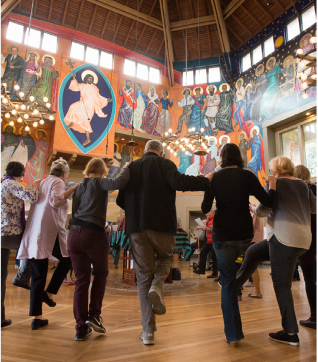
Photograph of worship at St. Gregory of Nyssa Episcopal Church, San Francisco ( episcopalliturgy.org , Nov. 18, 2016)

NINTH SUNDAY AFTER PENTECOST AUGUST 11, 2019 • 10:00 AM