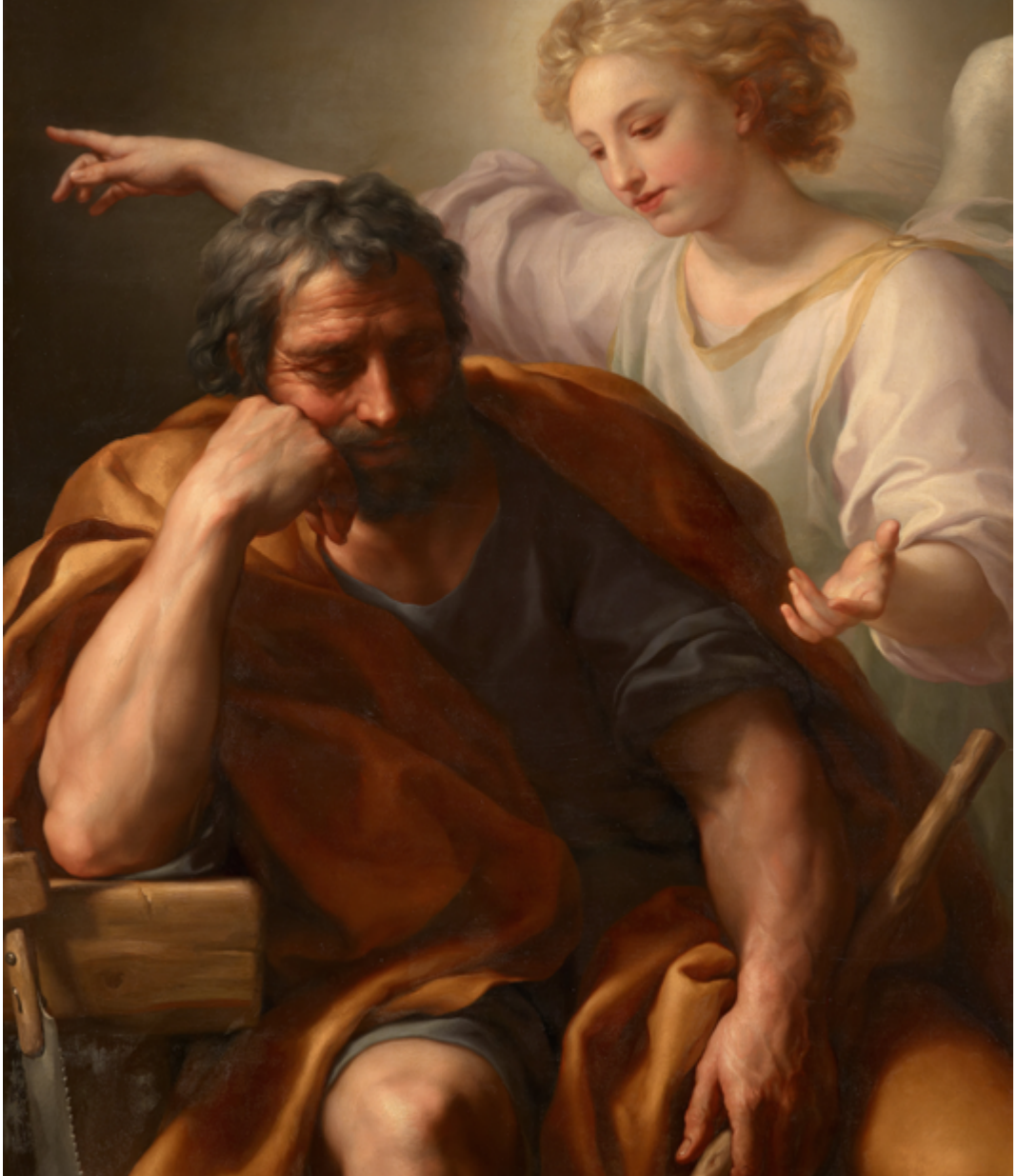
Anton Raphael Mengs, The Dream of St. Joseph , 1774