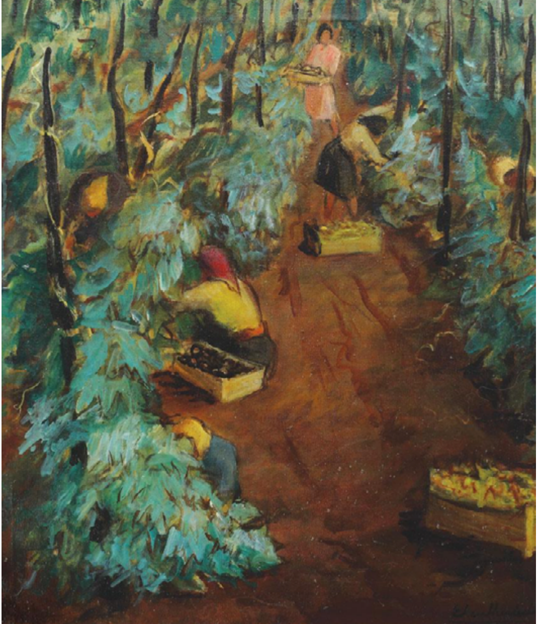
Micaela Eleutheriade, Vineyard Harvest , n.d.

TWELFTH SUNDAY AFTER PENTECOST SEPTEMBER 1, 2019 • 10:00 AM