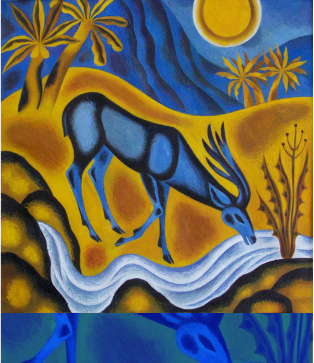
Catia Kuzmenko, Psalm 42 , 2005