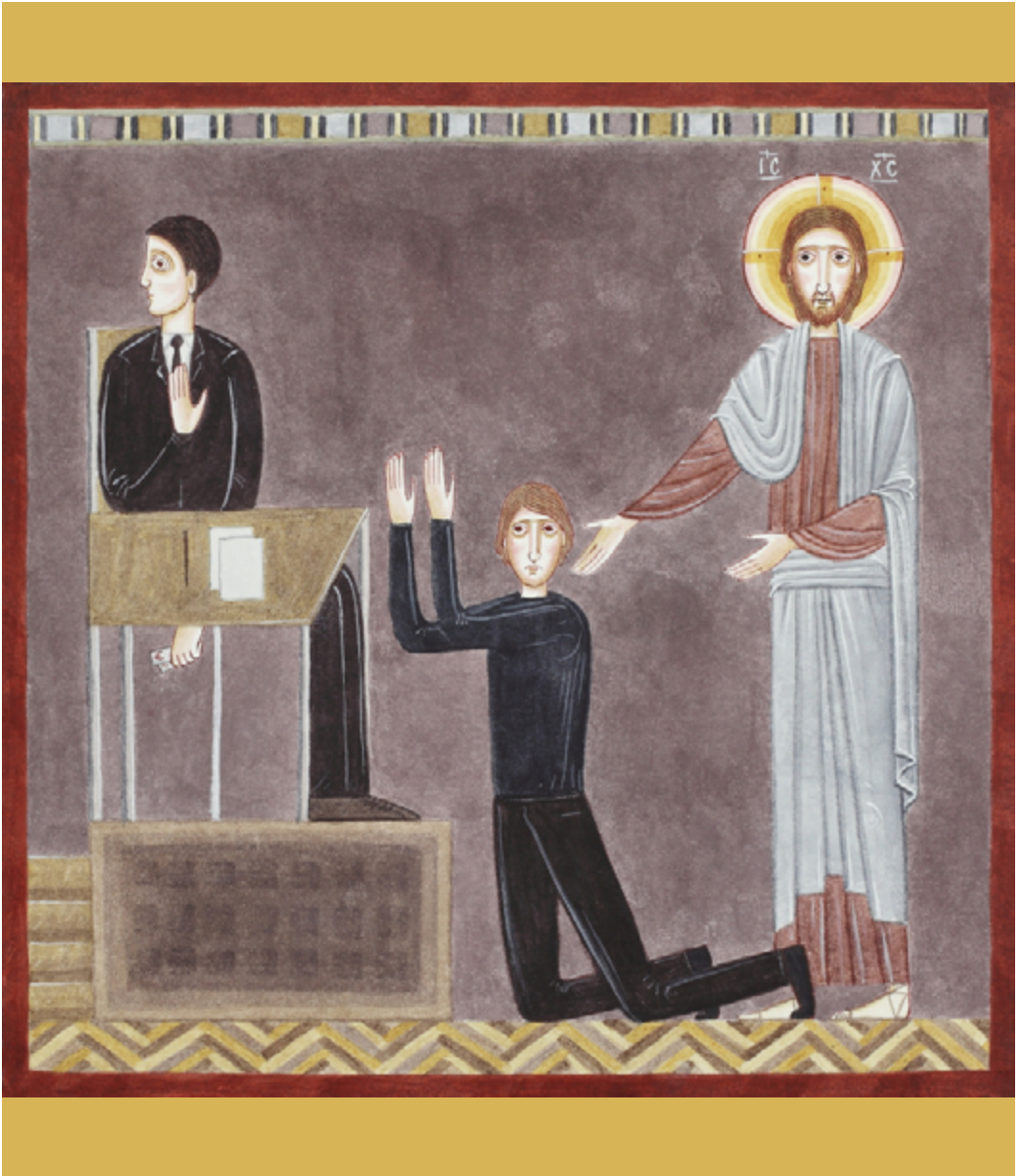
Nikola Sarić, Parable of the Unjust Judge , 2014