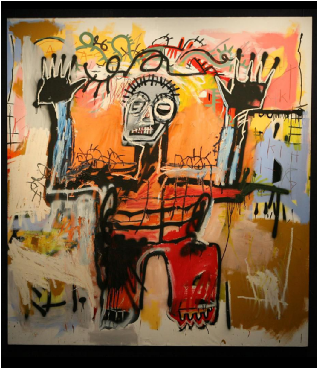
Jean-Michel Basquiat, Untitled , 1981