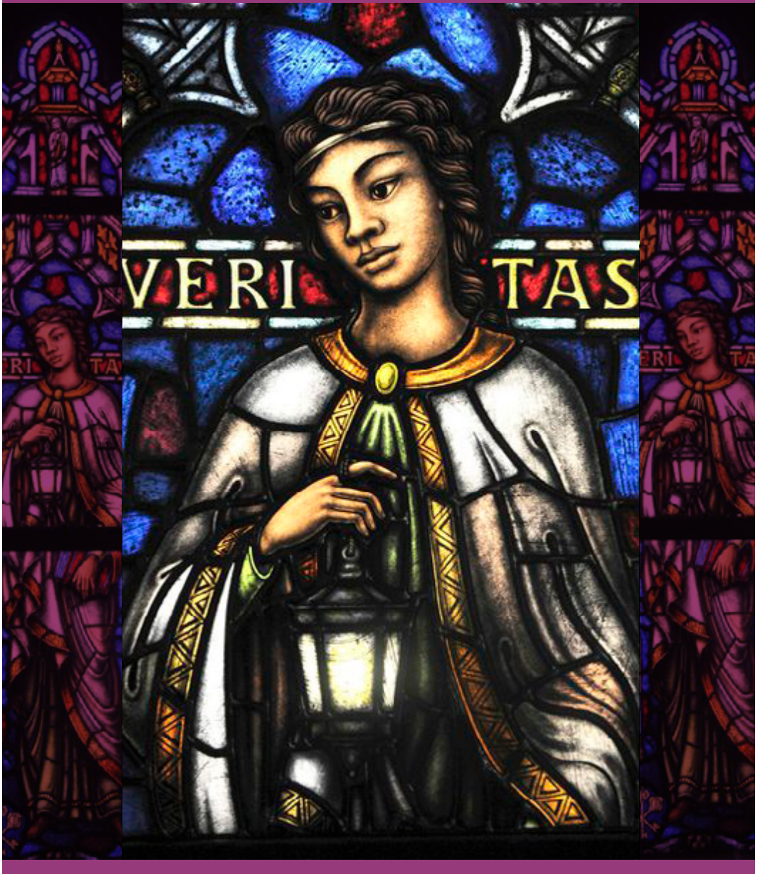
The Wright Window, Wellesley College, Houghton Chapel