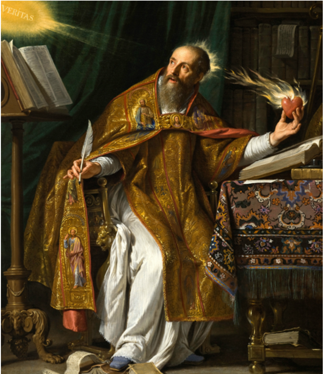
Philippe de Champaigne, Saint Augustine , ca. 1645–1650

BAPTISM OF THE LORD JANUARY 12, 2020 • 11:00 AM