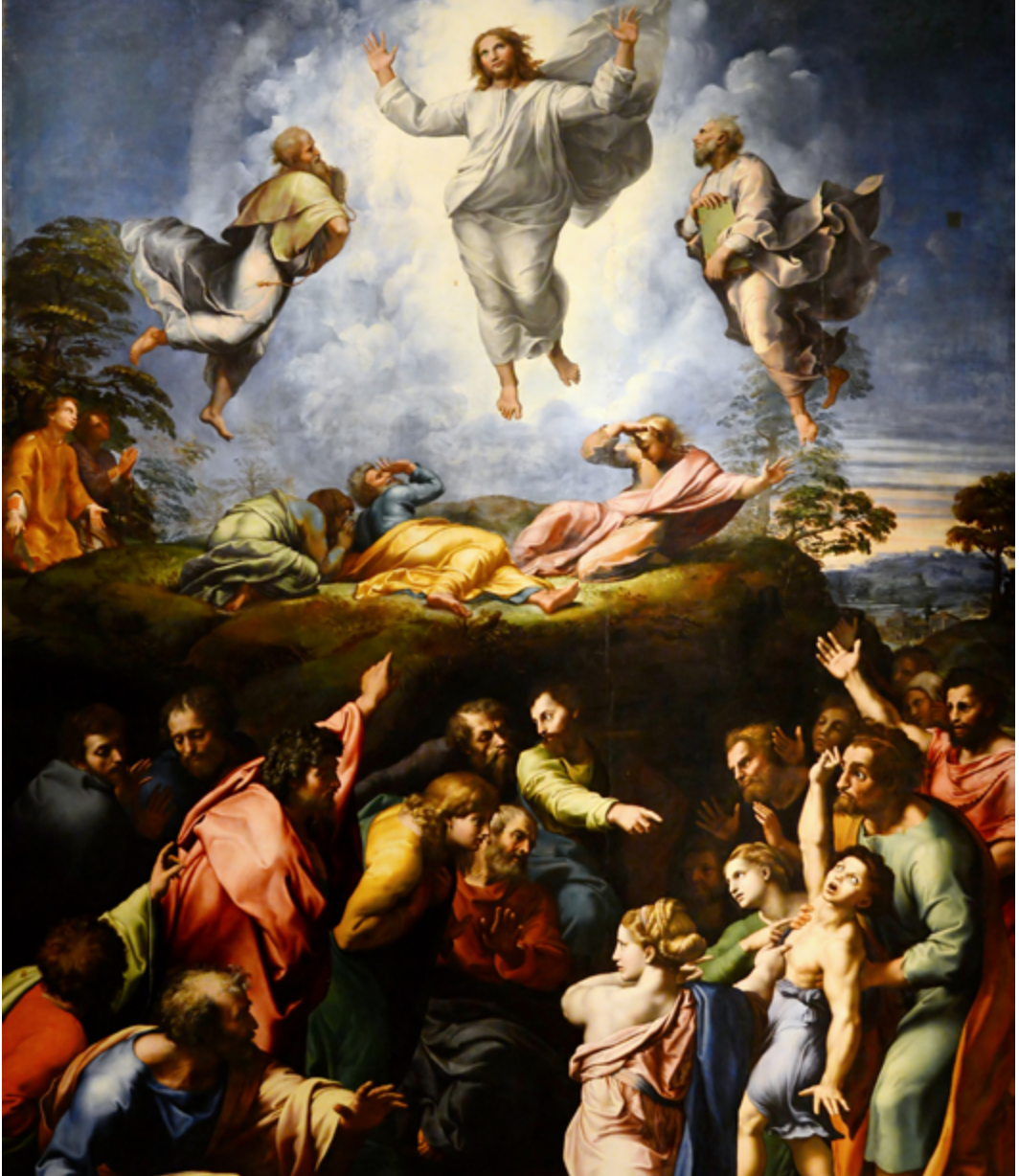
Raphael, The Transfiguration , 1518–1520