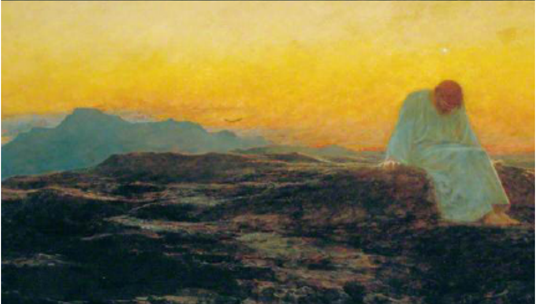
Briton Rivière, The Temptation in the Wilderness , 1898