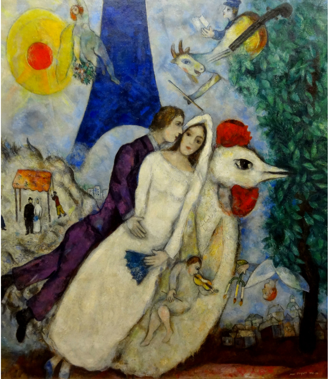
Marc Chagall, Les mariés de la tour Eiffel ( The Bride and Groom of the Eiffel Tower ), 1938–39.

TWENTY-SECOND SUNDAY AFTER PENTECOST OCTOBER 24, 2021 • 11:00 AM