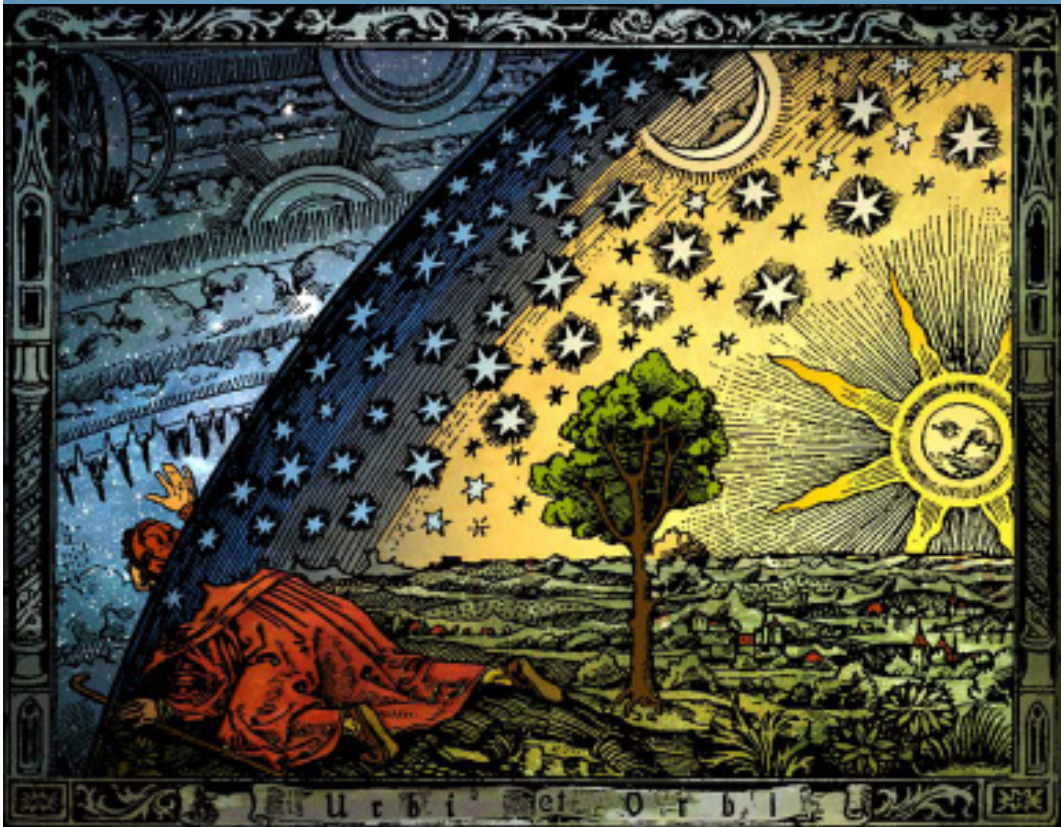
C. Flammarion, Universum , Paris, 1888

FIRST SUNDAY OF ADVENT NOVEMBER 28, 2021 • 11:00 AM