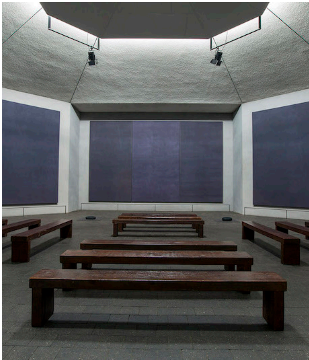
The Rothko Chapel, Houston, Texas