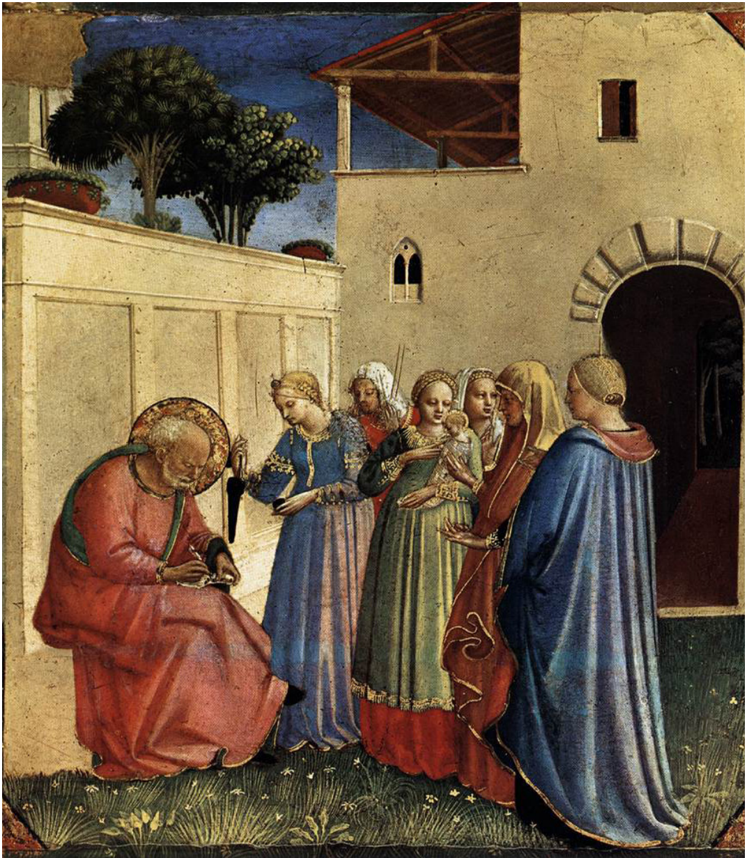
Fra Angelico, The Naming of John the Baptist , 1434