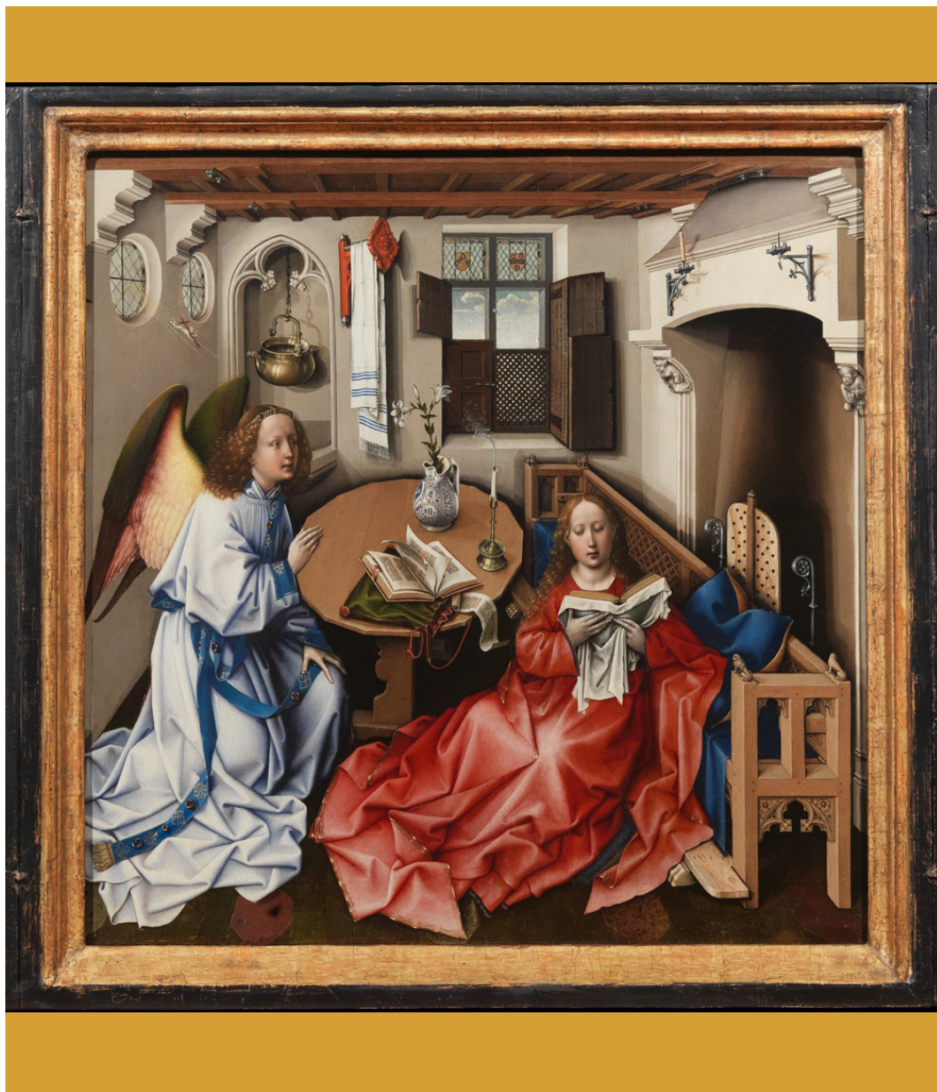
Robert Campin, The Merode Altarpiece , c. 1427