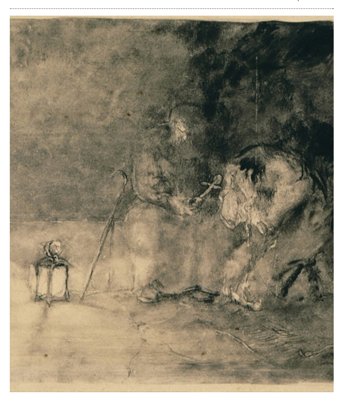
Nikolaos Gyzis, Repentance, 1875