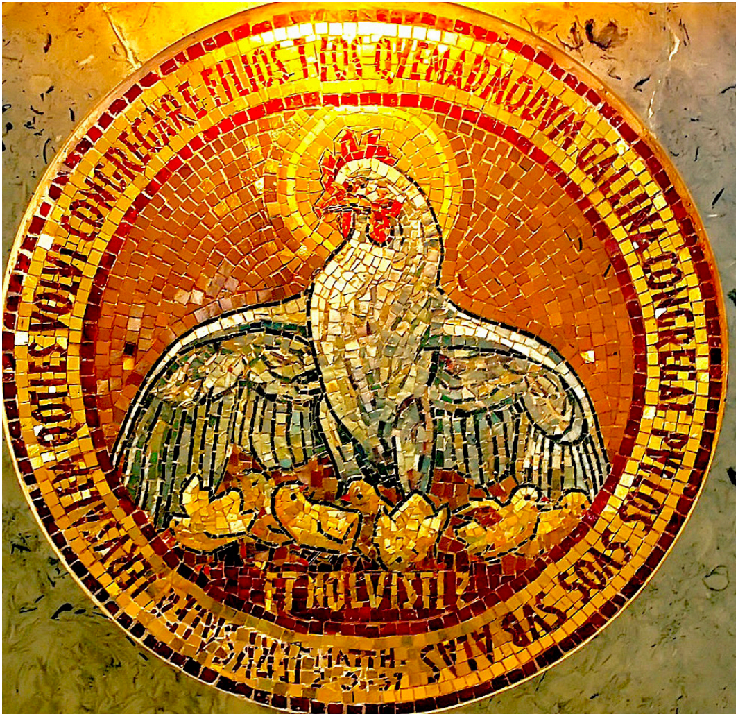
Altar Mosaic, Dominus Flevit Church, Jerusalem