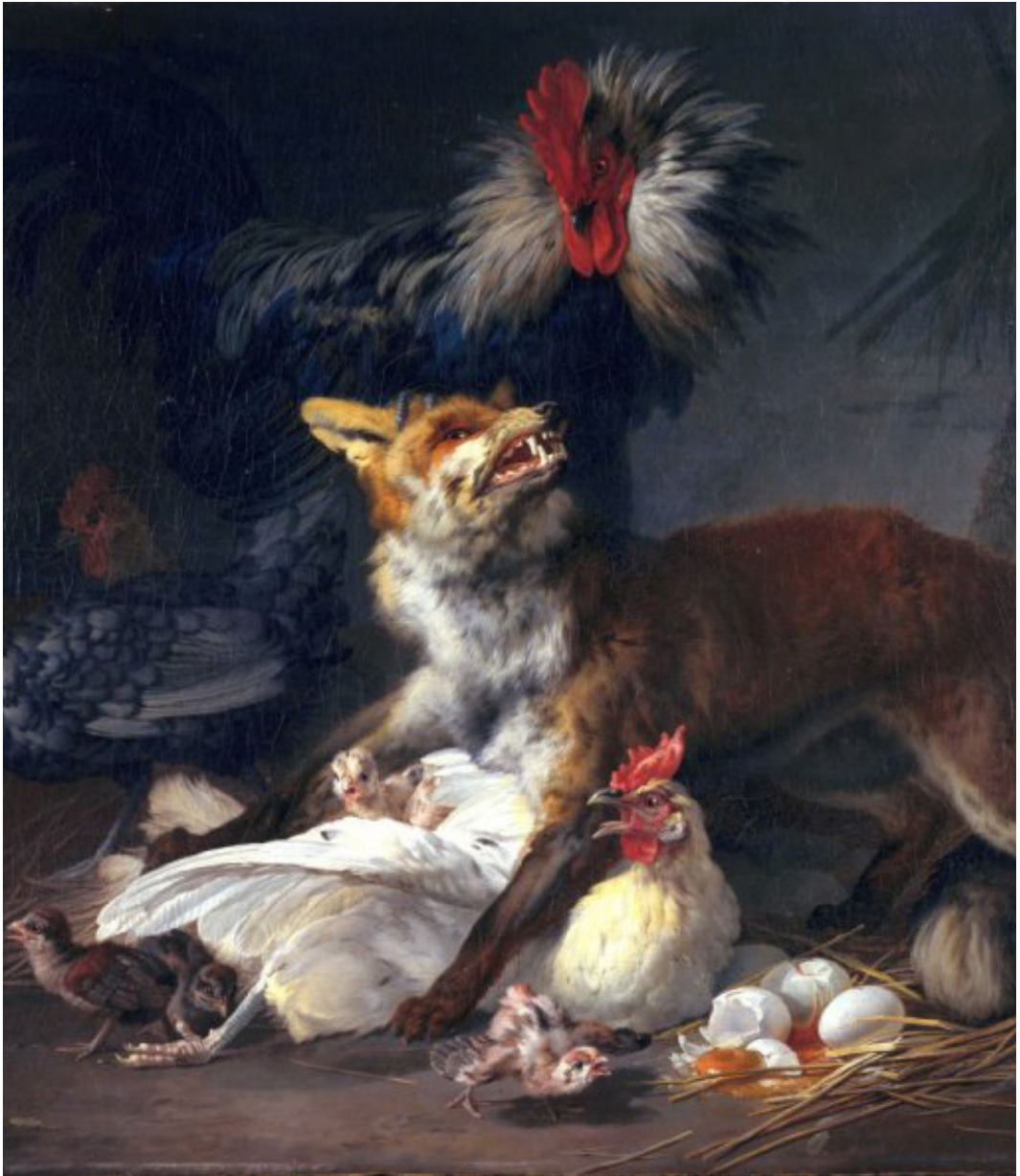
Jean-Baptiste Marie Huet, Fox in a Chicken Yard , 1766

SECOND SUNDAY IN LENT MARCH 13, 2022 • 11:00 AM