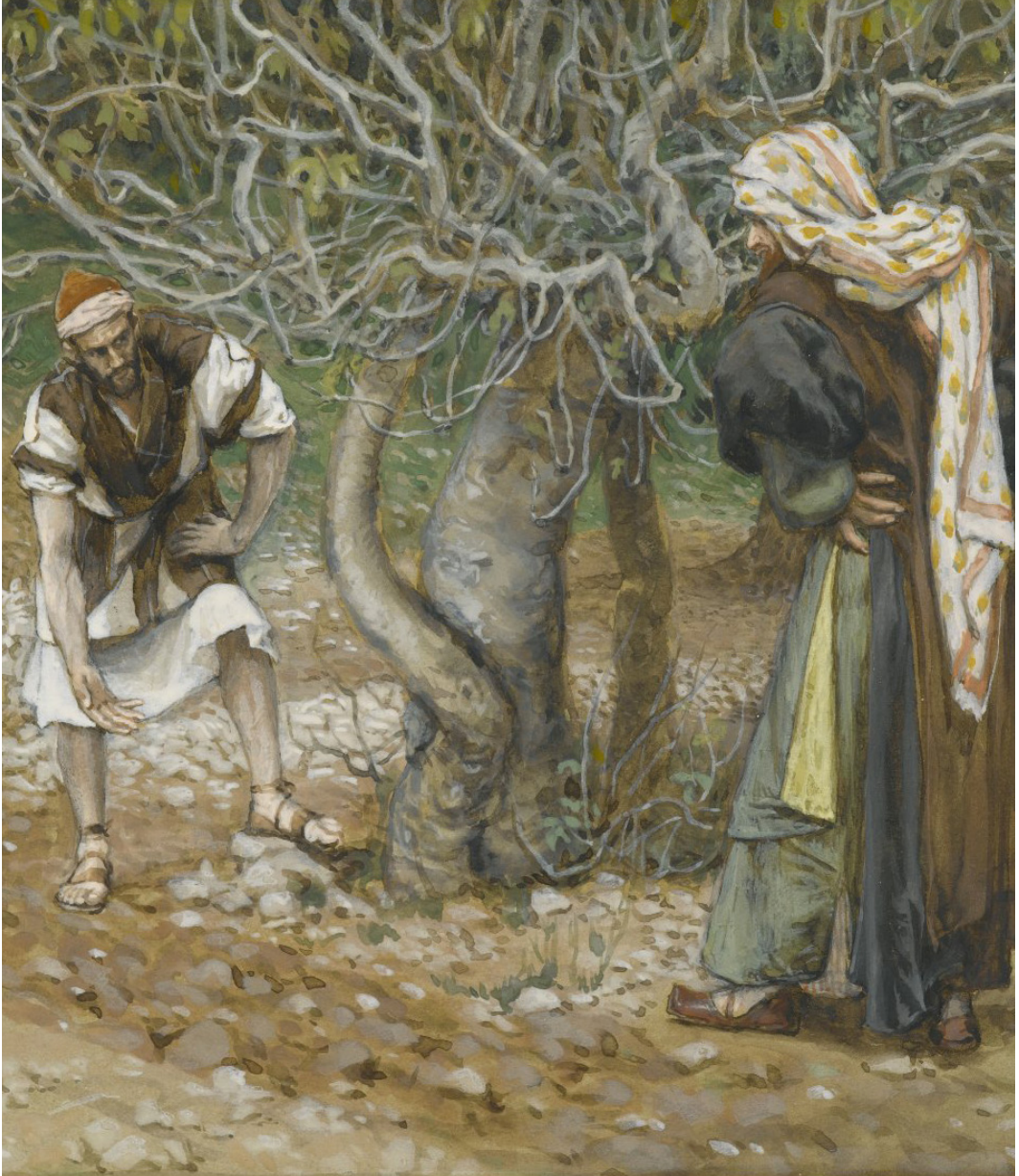
James Tissot, The Vine Dresser and the Fig Tree , c. 1886

THIRD SUNDAY IN LENT MARCH 20, 2022 • 11:00 AM