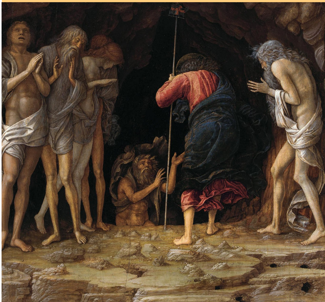
Andrea Mantegna, Christ's Descent into Limbo , c. 1470.

RESURRECTION OF THE LORD EASTER SUNDAY APRIL 17, 2022