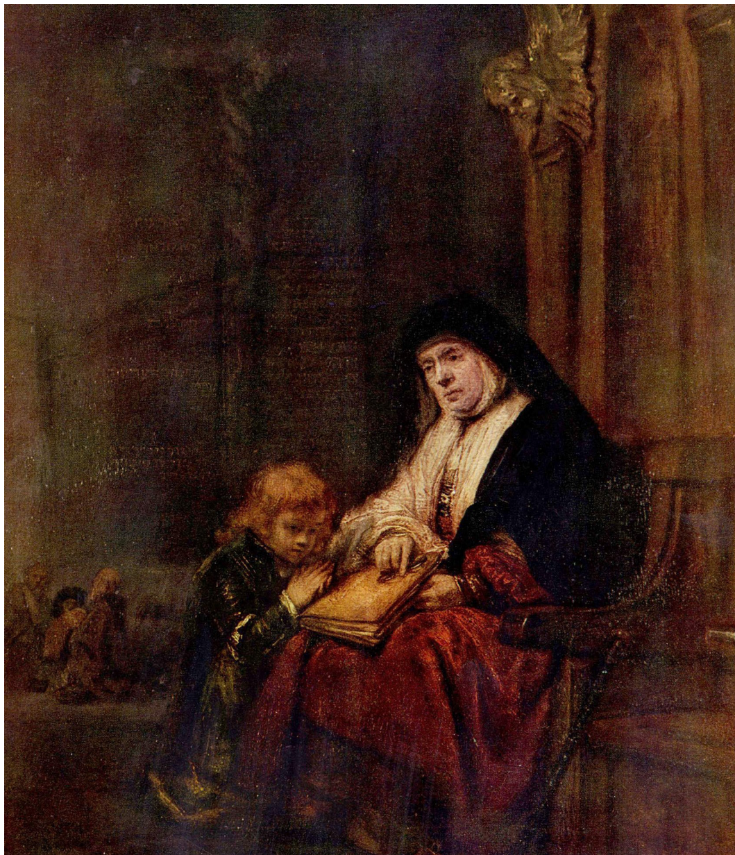
Rembrandt van Rijn, Timothy and his Grandmother , 1648

FOURTH SUNDAY OF EASTER MAY 8, 2022 • 11:00 AM