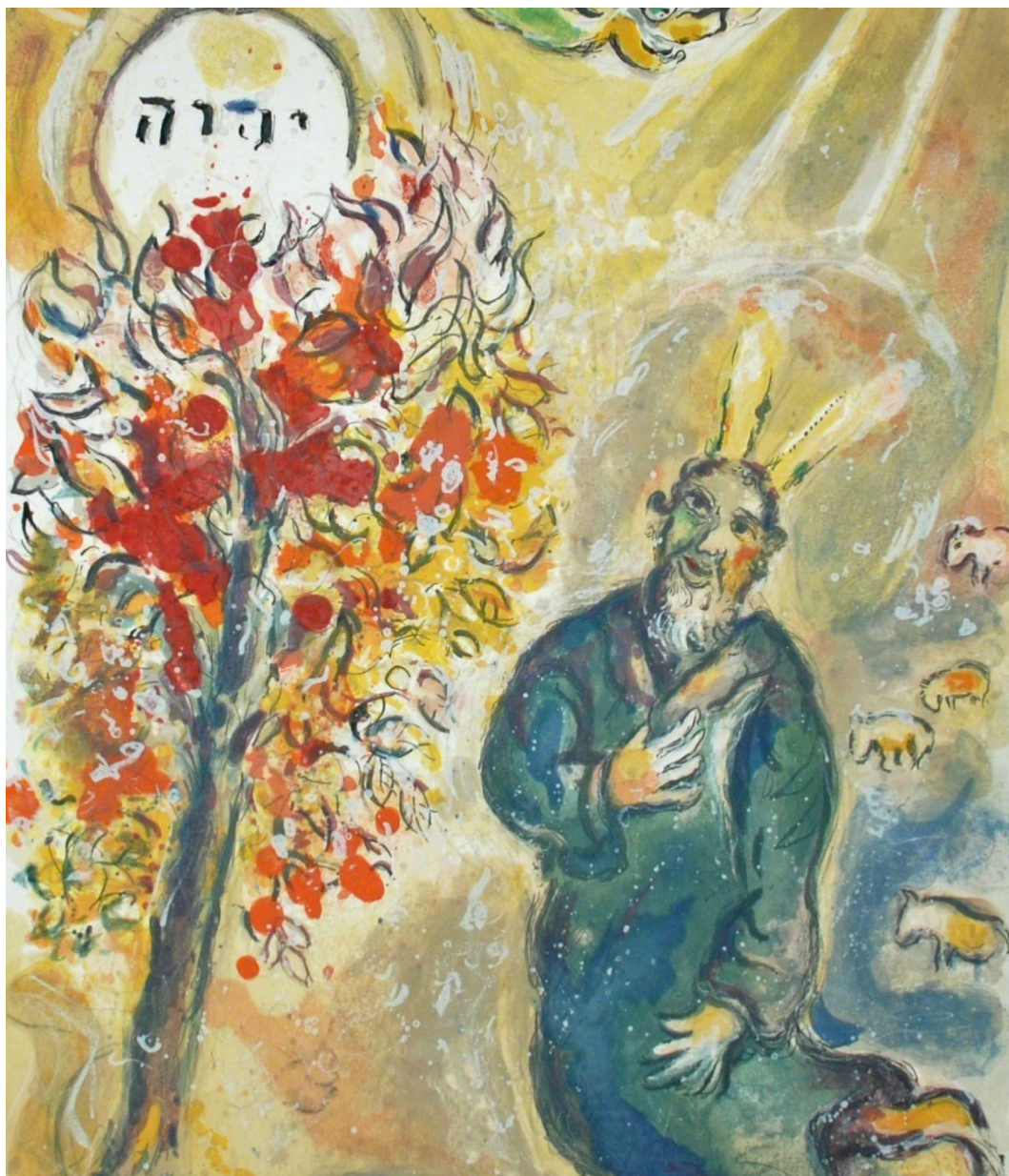
Marc Chagall, Burning Bush , 1966