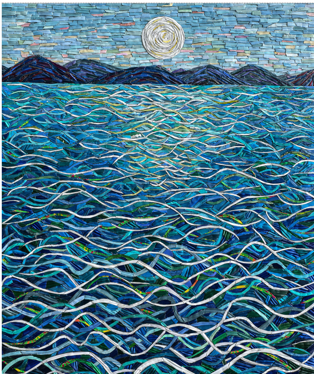
Toni Burrows, Moon Over Still Water Mosaic

NINTH SUNDAY AFTER PENTECOST AUGUST 7, 2022 • 10:00 AM