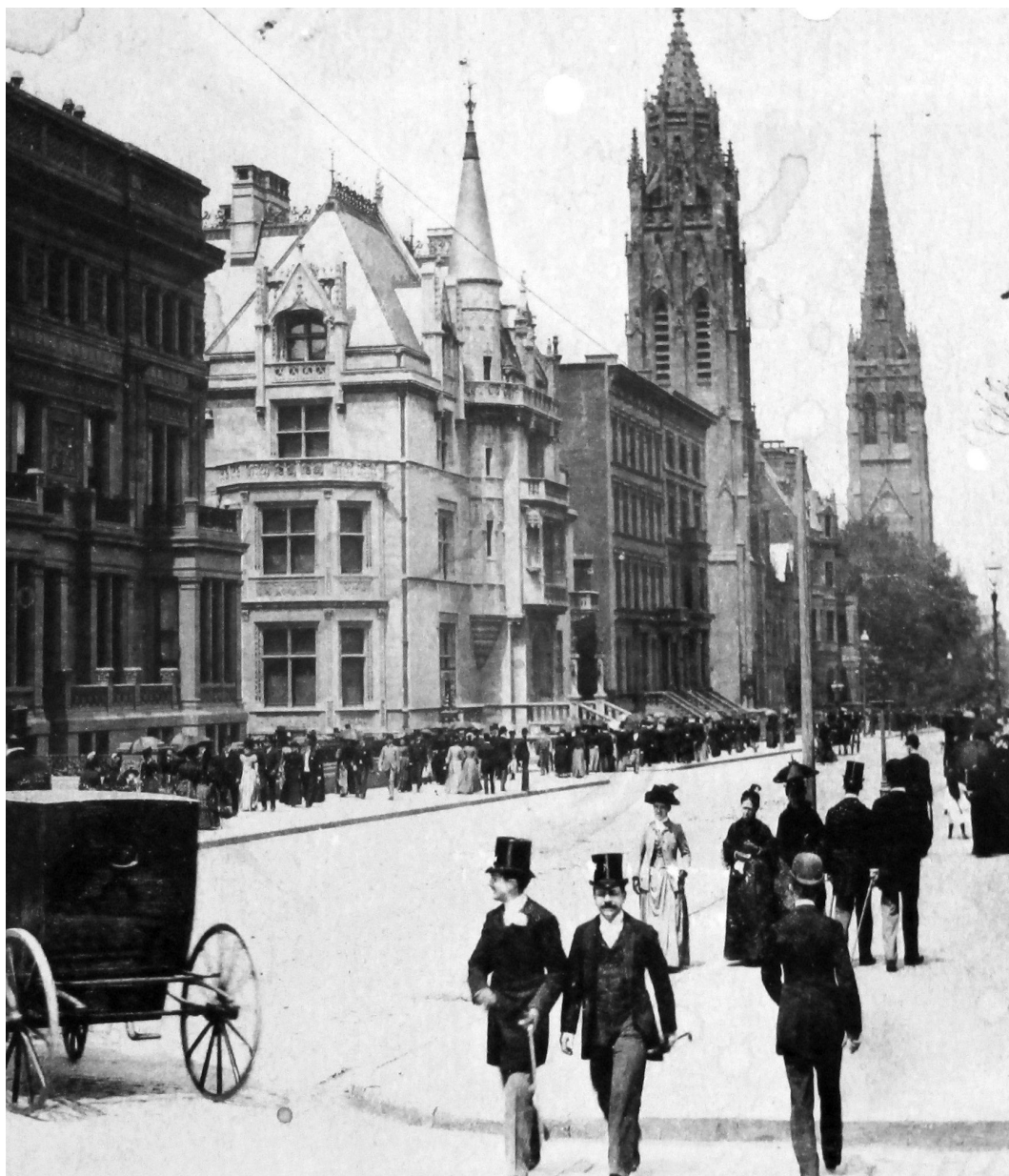
Fifth Avenue on Sunday, 1898.