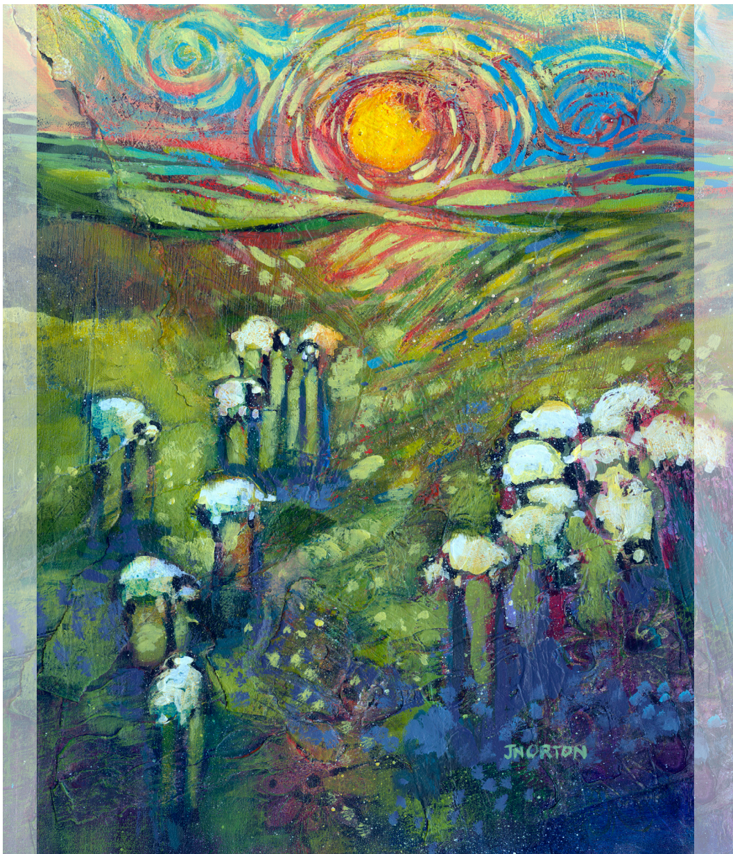
Jen Norton, Flock in the Promised Land , 2016

FOURTEENTH SUNDAY AFTER PENTECOST SEPTEMBER 11, 2022 • 10:00 AM