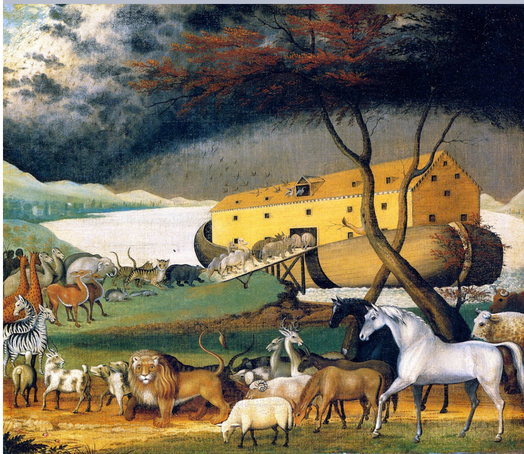
Edward Hicks, Noah's Ark , 1846

SIXTEENTH SUNDAY AFTER PENTECOST SEPTEMBER 25, 2022 • 11:00 AM