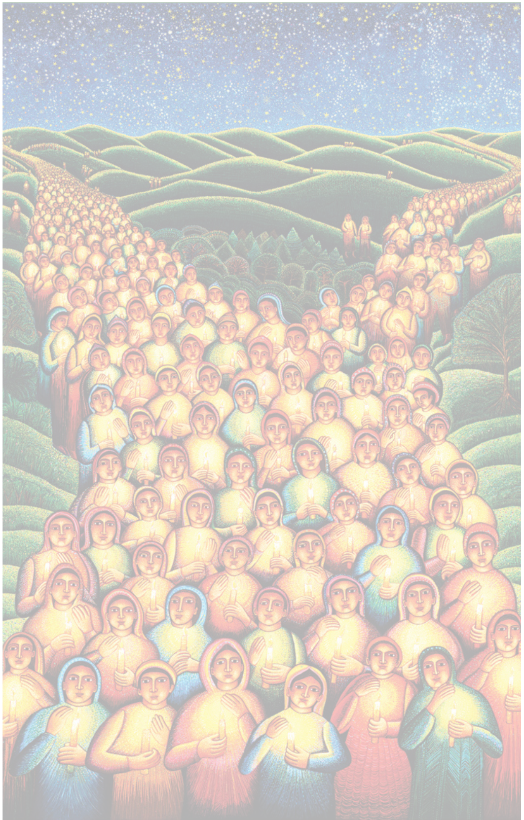
Cover Art: John August Swanson, Festival of Lights , 2000