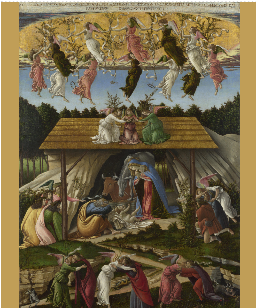
Sandro Botticelli, The Mystical Nativity , c. 1500–1501