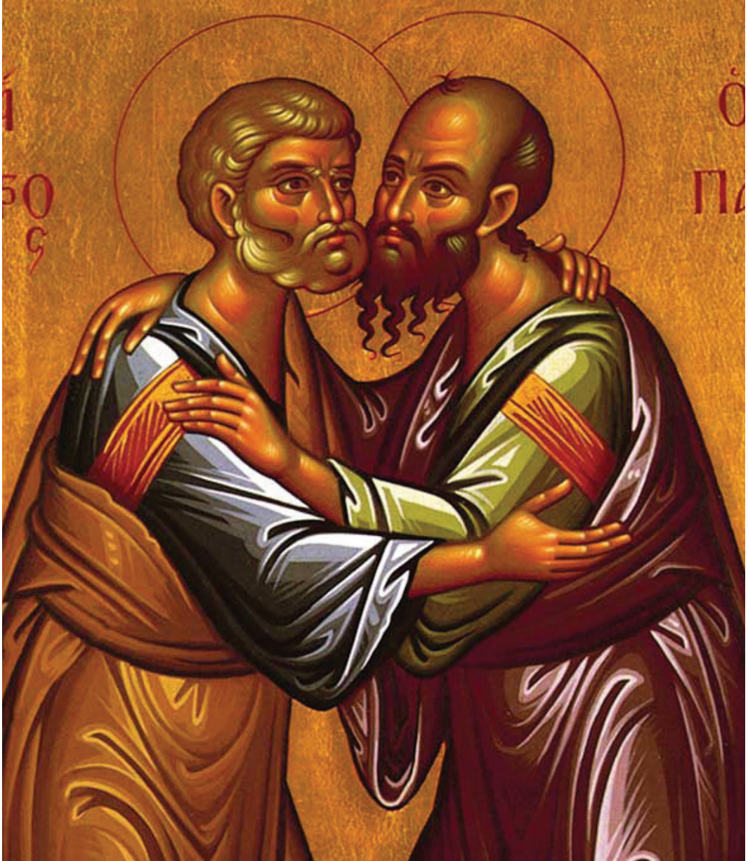
Peter and Paul Embracing After Their Dispute in Antioch, Painted Icon, c. early 15th century.

SIXTH SUNDAY AFTER EPIPHANY FEBRUARY 12, 2023 • 11:00 AM