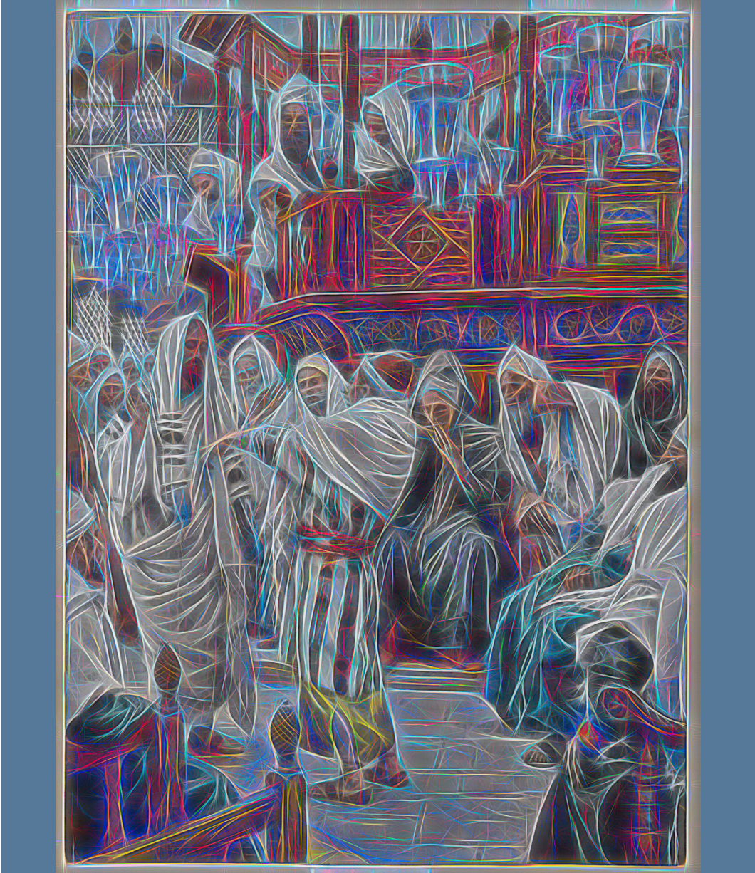
Artotop. Inspired by The Man with the Withered Hand , by James Tissot (1886-1896).

TRANSFIGURATION OF THE LORD FEBRUARY 19, 2023 • 11:00 AM