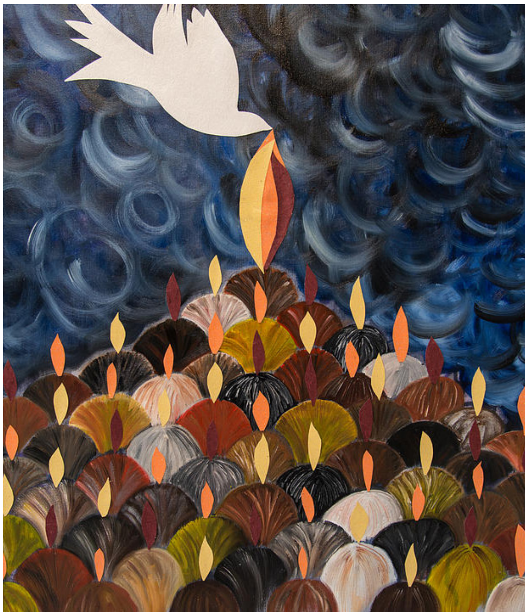
Marianne Gonzales, The Fire that Lights the Church

DAY OF PENTECOST MAY 28, 2023 • 10:00 AM