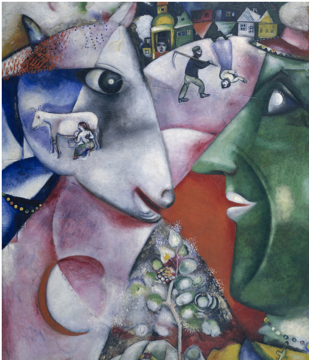
Marc Chagall, I and the Village , 1911